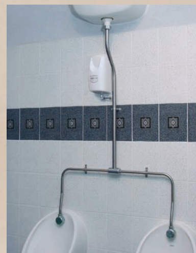
Typical urinal installation