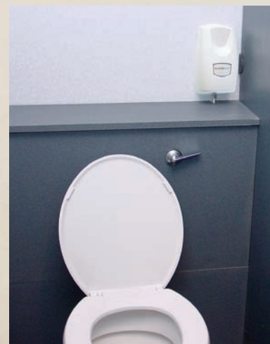
Typical W.C. installation

A complex biological formulation containing powerful cleaning agents and bacterial strains selected for their ability to digest waste materials preventing the formulation of scale and organic build-up. (This option is particularly suitable for use in conjunction with Water Management Systems).